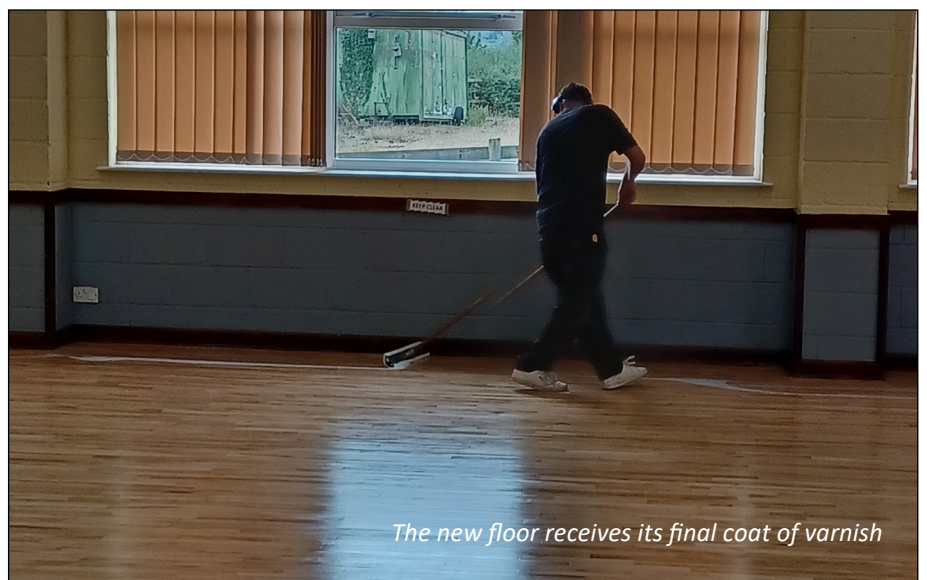
The new floor receives its final coat of varnish

As two committee members have retired in the last 12 months, we would like to appeal for volunteers to join our committee, so that the Village Hall can continue in a strong position to serve our community. Training can be provided if it is required, but your interest and enthusiasm is most important.